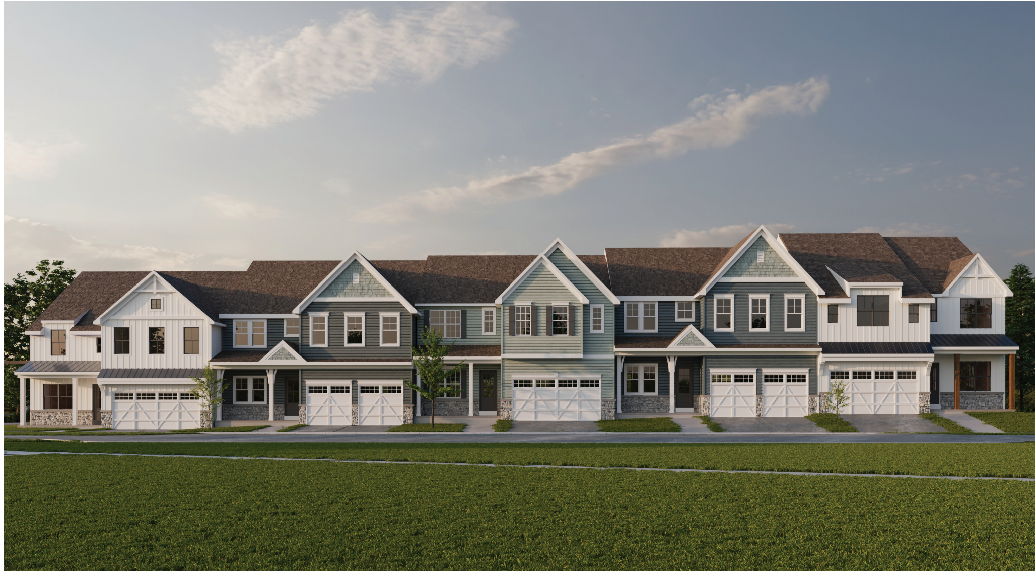
Elevations (Left to Right): Farmhouse, Heritage, Vintage, Heritage, Farmhouse Alternate