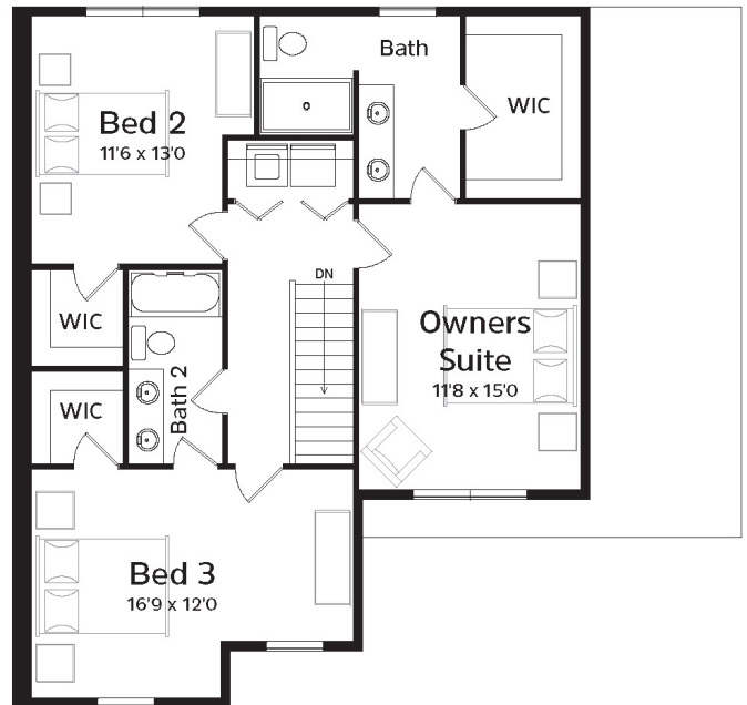
Second Floor 8ft. Ceilings Options Shown: Owners Suite Bath Package, and Bath 2 Double Bowl