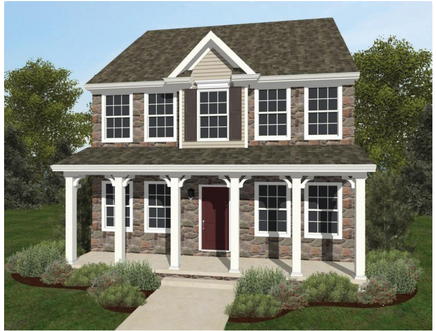
Traditional Elevation Options Shown: Facing Package 3