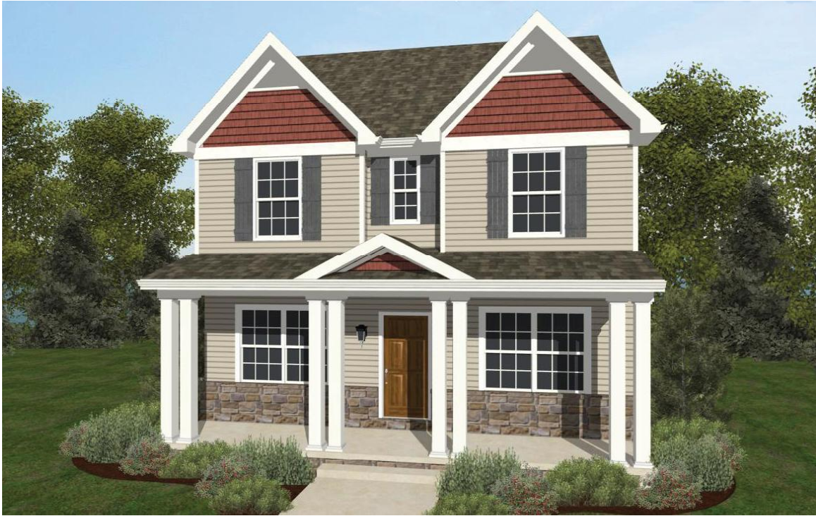
Vintage Elevation Options Shown: Facing Package 2