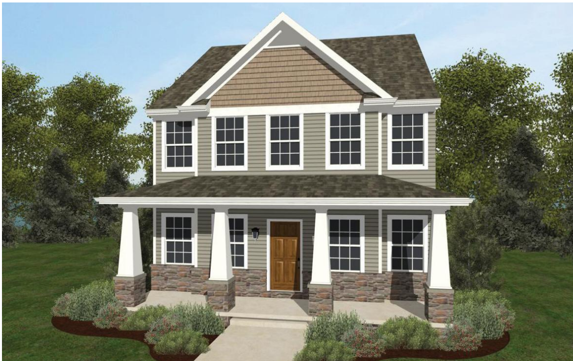
Heritage Elevation Options Shown: Facing Package 2